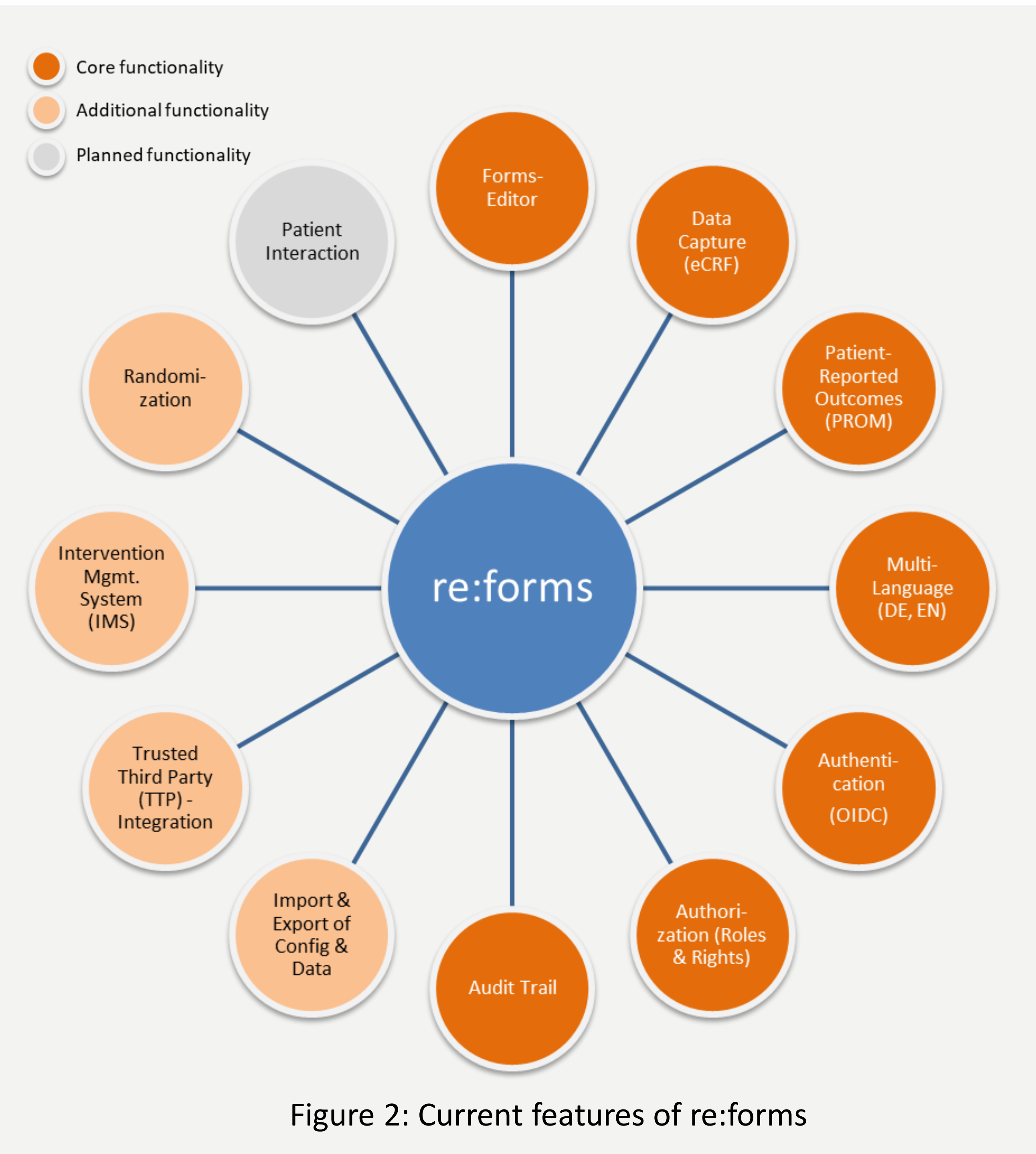
Figure 2: Current features of re:forms